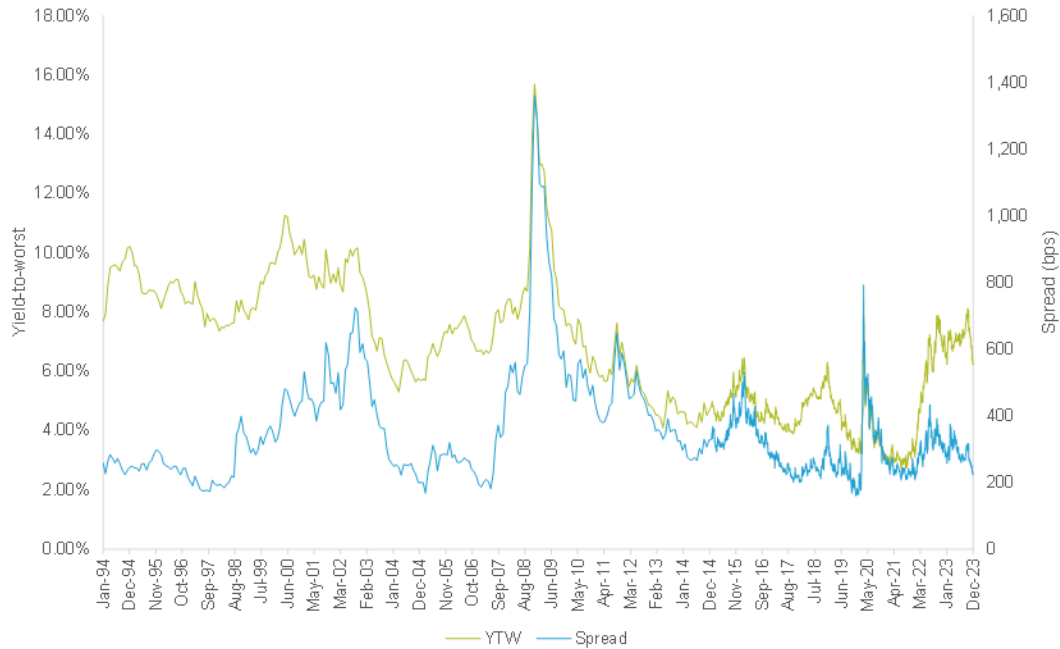
Bloomberg US Corporate High-Yield BB excluding Energy Yield-To-Worst (YTW) and Spread 6

Though yields in the high-yield market are in the realm of 15-year highs, we generally find that, compared to investment-grade bonds, the low spreads in the high-yield market do not offer enough incremental compensation for the extra credit risk. The following chart shows the spread of high-yield debt less the spread of investment-grade corporate debt. This incremental spread represents the extra yield offered in exchange for taking on more credit risk. This spread is currently in the 6th to 15th percentile of the history, which means that investors are getting paid relatively little to take on the extra credit risk associated with high-yield debt. 7