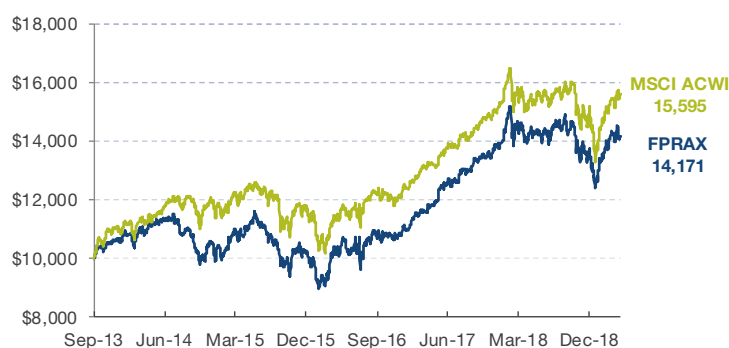
FPA Paramount Fund(NAV)/ MSCI ACWI: Growth of $10,000 4

The MSCI ACWI Index is an unmanaged free float-adjusted market capitalization weighted index that is designed to measure the equity market performance of developed and emerging markets. The MSCI ACWI consists of 44 country indices comprising 23 developed and 21 emerging market country indices. An investor cannot invest directly in an index. Comparison to the MSCI ACWI Index is for illustrative purposes only. The Fund does not include outperformance of any index or benchmark in its investment objectives. Index returns do not reflect transactions costs, investment management fees or other commissions, fees and expenses that would reduce performance for an investor.