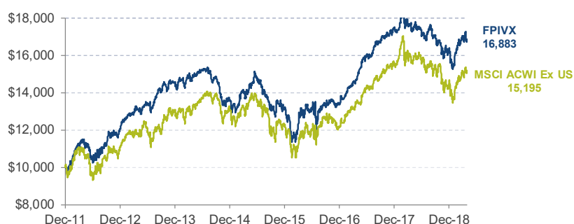
FPA International Value (NAV)/MSCI ACWI Ex US: Growth of $10,000 3

The MSCI All Country World ex-USA (Net) Index is a float-adjusted market capitalization index that is designed to measure the combined equity market performance of developed and emerging market countries excluding the United States. An investor cannot invest directly in an index. Comparison to the MSCI ACWI ex US Index is for illustrative purposes only. The Fund does not include outperformance of any index or benchmark in its investment objectives. Index returns do not reflect transactions costs, investment management fees or other commissions, fees and expenses that would reduce performance for an investor.