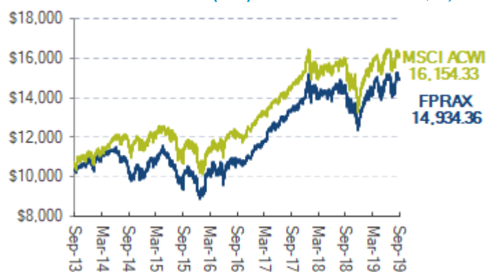
FPA Paramount Fund(NAV)/ MSCI ACWI: Growth of $10,000 4

The MSCI ACWI Index is an unmanaged free float-adjusted market capitalization weighted index that is designed to measure the equity market performance of developed and emerging markets. The MSCI ACWI consists of 44 country indices comprising 23 developed and 21 emerging market country indices. An investor cannot invest directly in an index. Comparison to the MSCI ACWI Index is for illustrative purposes only. The Fund does not include outperformance of any index or benchmark in its investment objectives. Index returns do not reflect transactions costs, investment management fees or other commissions, fees and expenses that would reduce performance for an investor.