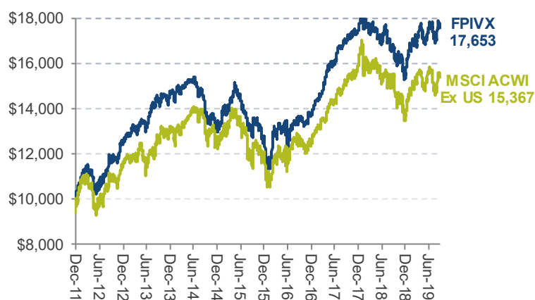
FPA International Value (NAV)/MSCI ACWI Ex US: Growth of $10,000 3

The MSCI All Country World ex-USA (Net) Index is a float-adjusted market capitalization index that is designed to measure the combined equity market performance of developed and emerging market countries excluding the United States. An investor cannot invest directly in an index. Comparison to the MSCI ACWI ex US Index is for illustrative purposes only. The Fund does not include outperformance of any index or benchmark in its investment objectives. Index returns do not reflect transactions costs, investment management fees or other commissions, fees and expenses that would reduce performance for an investor.